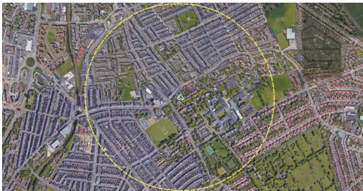
FIGURE 4: SITE AND SETTING (Reproduced under licence from Google Earth Pro.)