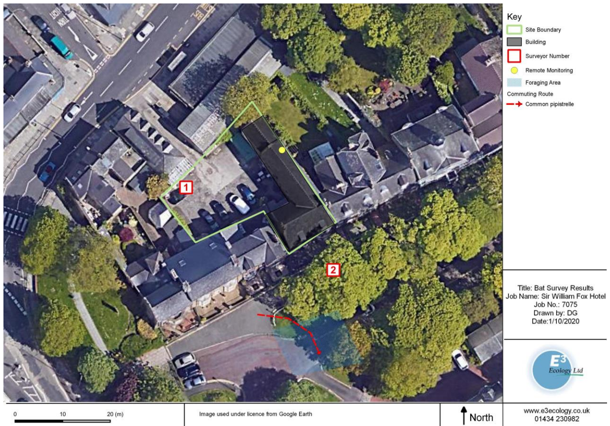
FIGURE 6: SUMMARY OF DUSK EMERGENCE SURVEY RESULTS