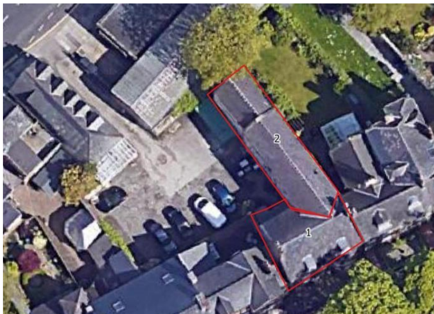
FIGURE 5: BUILDING LOCATIONS