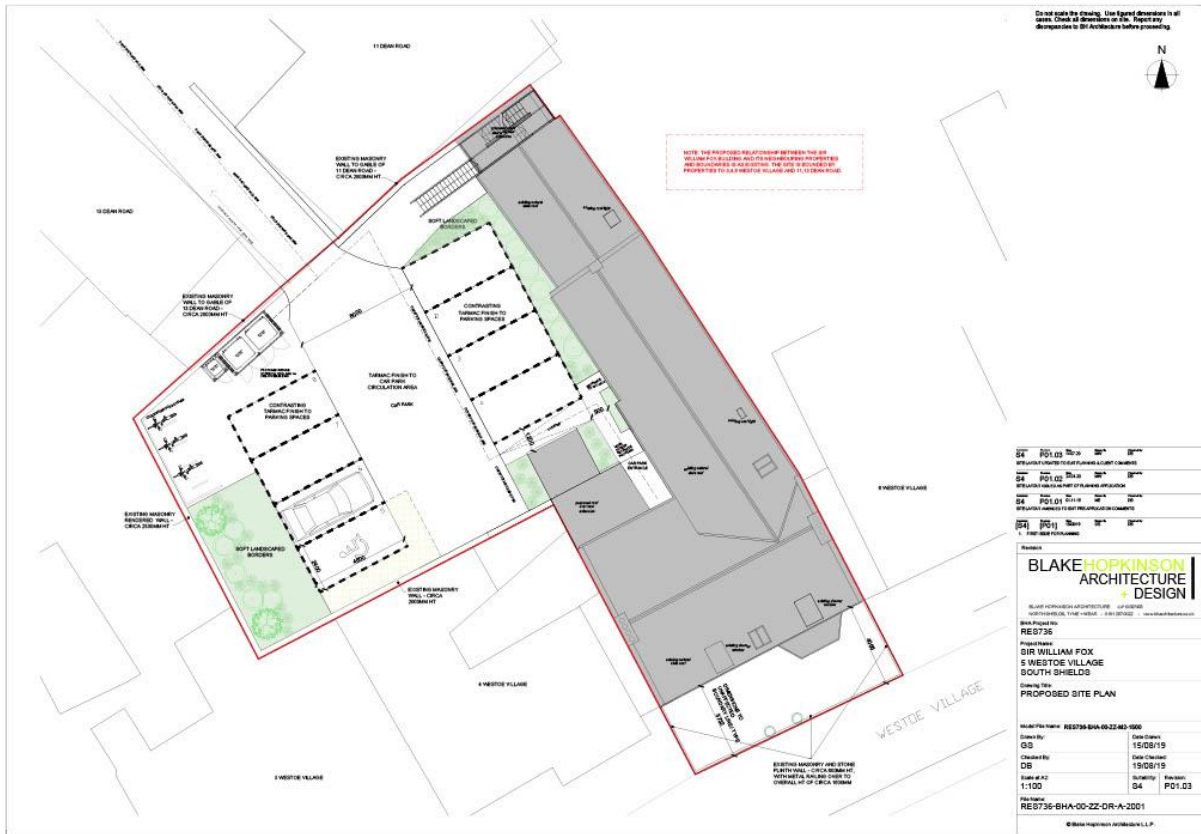
FIGURE 2: DEVELOPMENT PROPOSALS (Blake Hopkinson Architecture Design)